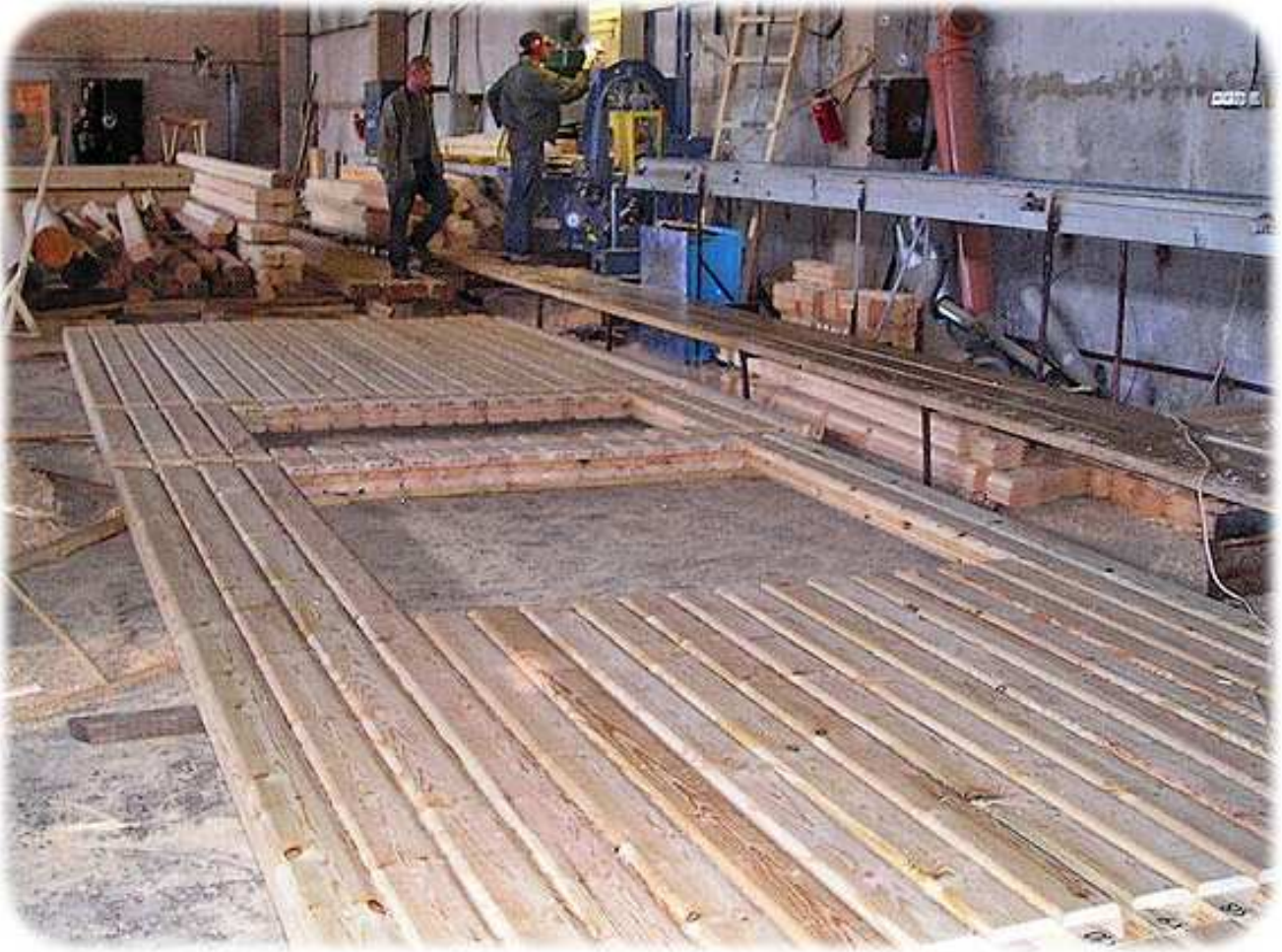
Montage du chalet à la fabrique en Biélorussie pour contrôle avant expédition