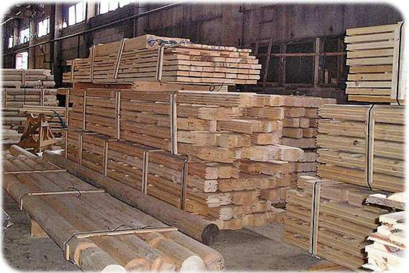
Emballage de chaque élément composant le kit, numérotés pour en faciliter le montage